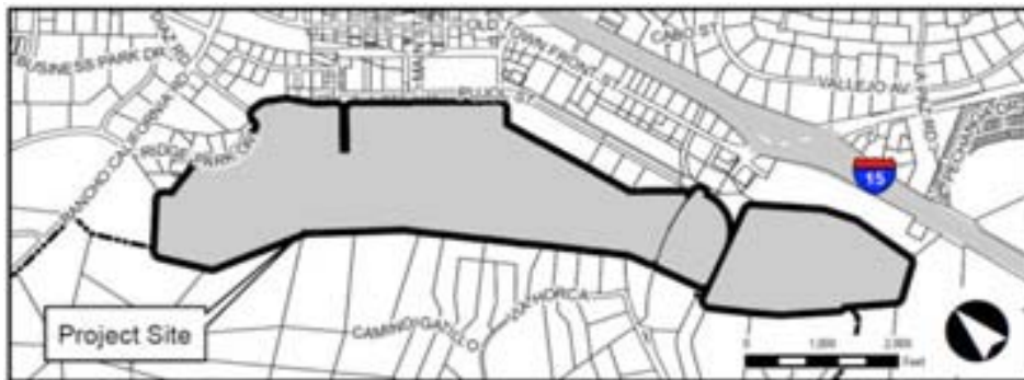
ALTAIR development site

Temecula City Planning Commission recommended adoption of the Altair final documents. We are continuing meetings with agencies, non-profits, city staff and developer. This housing tract proposal of at least 1750 units on the west side of I-15 will be positioned between the hillside and adjacent the housing west of Old Town. In addition, a Western Bypass will run along the upside of the development. There are several problems with this kind of housing density on this strip of land. Increased traffic (over 3000 more cars), air quality, aesthetics of our valley and impacts on the wildlife corridors and last wildlife crossing at I-15 are a few. We will be voicing our opposition to the proposal at the City Council Meeting on December 12, 2017. Please contribute to our wildlife crossing and