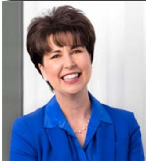
SENATOR CONNIE LEYVA

But wait. There's more! We also had four legislative representatives