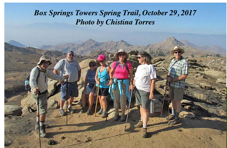
Box Springs Towers Spring Trail, October 29, 2017

Lake Perris State Recreation Area: The 2018 Limited Use Golden Bear Pass ($20.00) to most state parks is good from January 1 through December 31 for those 62 years or older and can be purchased at Lake Perris; it is good for everyone in your car. State park passes also include the Disabled Discount Pass and Distinguished Veteran Pass. For information on hours, visitors fees, and passes, please check: http://www.parks.ca.gov/?page_id=651