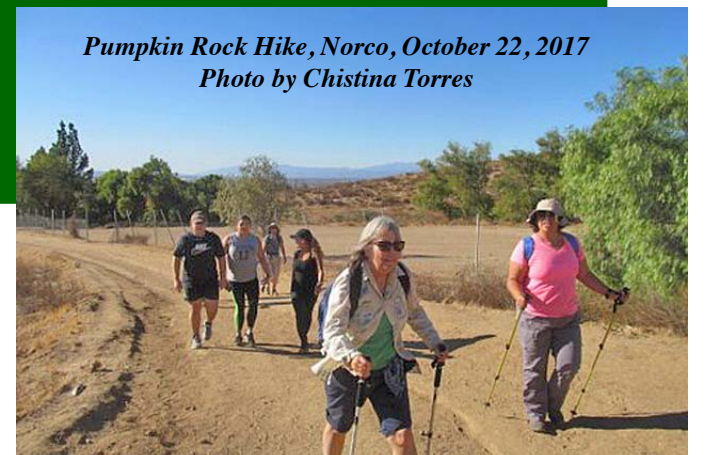
Pumpkin Rock Hike, Norco, October 22, 2017